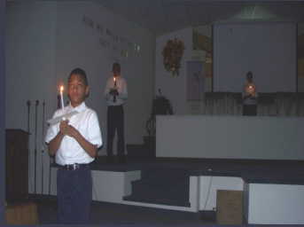
Candlelight ceremony by SJPWC Prep Academy Students