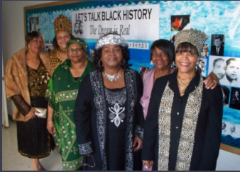
Models at the Black History Program