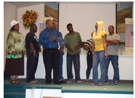
The Cast of Real Talk

SJPWC's 2012 Resurrection Celebration was fruitful as well as entertaining. To God be the Glory for the ministry of our Lord and Savior Jesus, The Christ! A special thanks to all that participated. You did a great job in Jesus' Name!